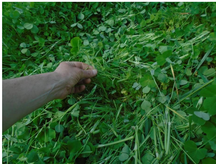
Photo 6. Chopped crimson clover herbage mass after a single pass of the roller-cutter

Testing has proven that the crimson clover can be efficiently laid down and chopped in just a single pass with the horse-drawn roller-cutter, with no use of fossil fuel. The investigated roller-cutter obviously needed just a little of energy for its operation. Namely, the mare which pulled the implement didn't show signs of fatigue during the work, thus indicating that there were low traction forces required. Effectivity of the roller-cutter was quite good. All the present herbage of crimson clover was cut and laid down, with no intact plants remained, thus enabling for easy plowing-under the herbage. Chop lengths after a single pass of the implement were from 17 to 37 cm (Photo 6).