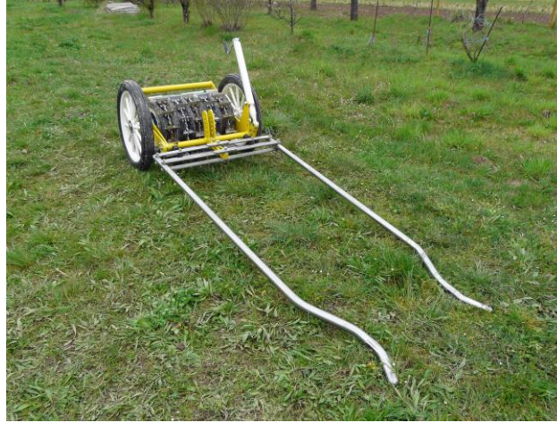
Photo 3. Double traction shafts in front of the roller-cutter for hitching a single horse

Photo 2. Blades on steel rings over the rubber drum on horse-powered roller-cutter for chopping the crimson clover herbage in this research (designed by Schaff mat Paerd asbl., Luxembourg)