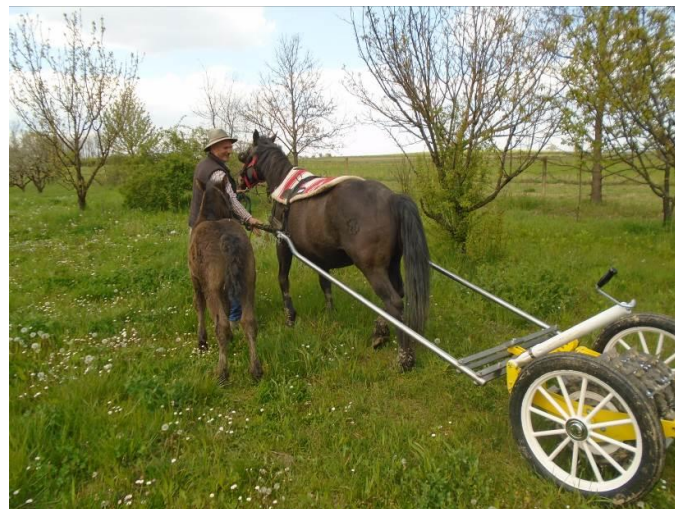
Photo 4. Croatian Heavy Draft Horse mare with the roller-cutter hitched