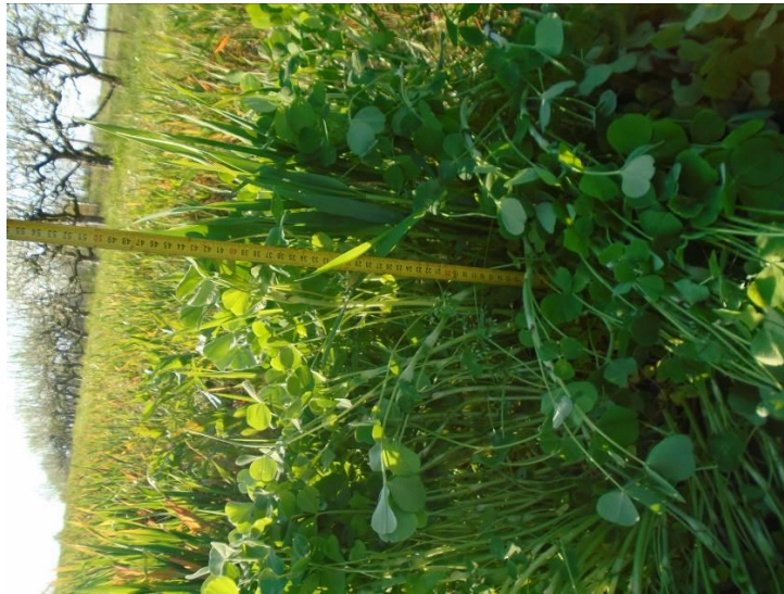
Photo 4. Intact herbage mass of the crimson clover before chopping

Testing was performed on a small field near Požega town (arable parcel of 3000 m 2 in total, but rolling was done on less than a half of the area), on 22 nd April 2023, on a crimson clover ( Trifolium incarnatum L.) crop grown for green manuring, with some volunteering oats. Crimson clover was seeded in early September 2022. At places where the chop length was measured, before the pass of the implement the crimson clover plant height was between 38 and 43 cm (Photo 4), and the clover's stand and canopy were dense. Crimson clover was in a late vegetative stage with soft stems. The roller-cutter was drawn by the Croatian Heavy Draft Horse mare (Photo 5), approximate bodyweight of 650 kg.