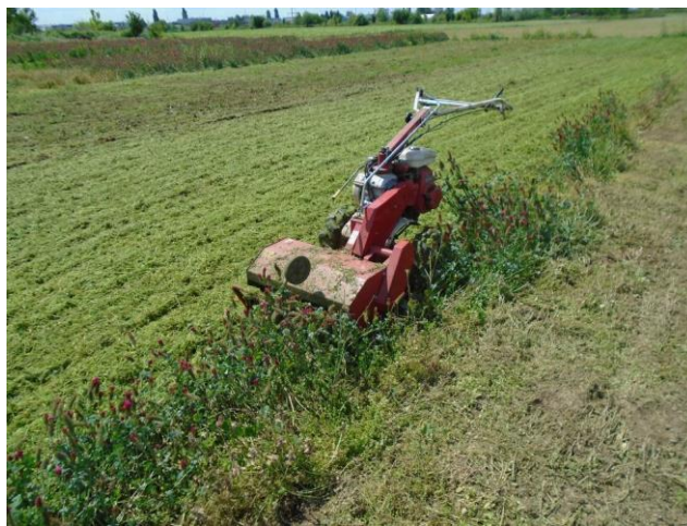
Photo 1. Gasoline-powered mini-tractor Honda F-620 Y coupled with MIO Standard mulcher used to chop the crimson clover herbage in previous researches

herbage decomposition, and release of plant nutrients from herbage into soil (Photo 1). However, if there is an ambition to completely avoid the consumption of fossil fuels, this requires an alternative implement to chop the herbage before plowing it under. Recently, the Schaff mat Paerd asbl. of Luxembourg has designed a prototype of roller-cutter aimed for chopping the herbage mass for green manuring (photos 2 and 3). This roller-cutter is intended for small farms that employ animal power for agricultural operations. Therefore, it is a light-weight implement with cutting blades driven by rolling action of oval knife-fitted stainless steel rings around a rubber roller, rolled over the soil surface. Aim of this preliminary research was to obtain a quick appraisal of the roller-cutter's performance in chopping the green manure's herbage for subsequent plowing it under and seedbed preparation.