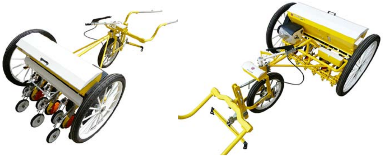
Traditional design meets modern technology on a draft horse implement by "Schaff mat Päerd"

Europe. My own experiences of the last nearly twenty years with horse drawn implements as "hobby" farmer, with a lot of trial and errors have taught me that we Europeans should not try to simply copy the plain people in USA, but that we have to find our own way in using draft horses, this with deep and honest respect for the living energy source which we use in form of our draft horses.